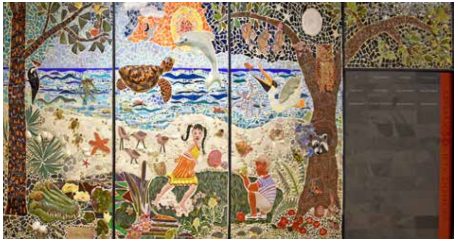
Legacy Society members are recognized in the front hall of the Childcare Resources School

Will you consider joining our legacy society by giving an endowed gift? An endowed gift will increase the impact of your giving by allowing Childcare Resources to invest your gift and use the annual earnings to further our important mission.