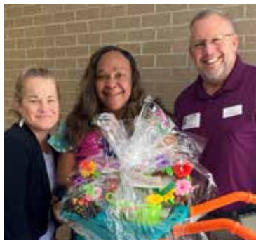
Providing technical assistance.