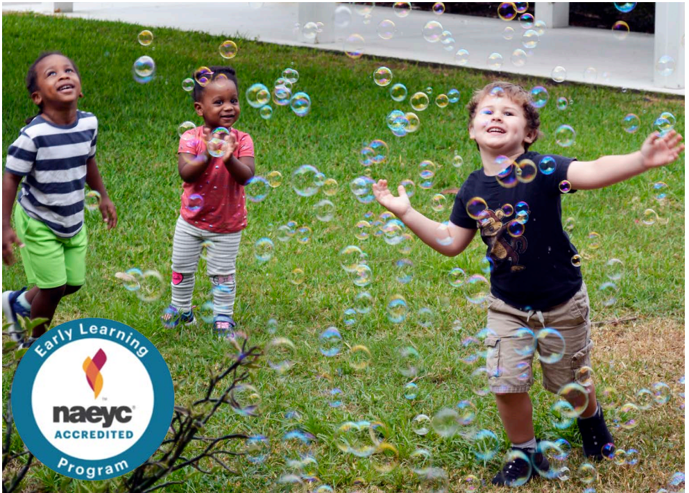
NAEYC's Week of the Young Child occurs each April. During this week, the Childcare Resources School is full of special learning experiences and themed days. Pictured is Bubble Day, during which children engage in sensory play and are introduced to scientific concepts like surface tension.