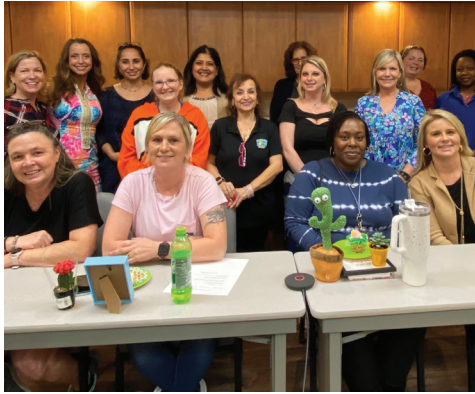
Center directors gather for monthly educational networking opportunities hosted by Childcare Resources.